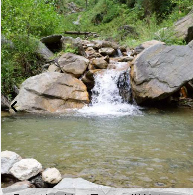
Breathtaking Tranquil Waters