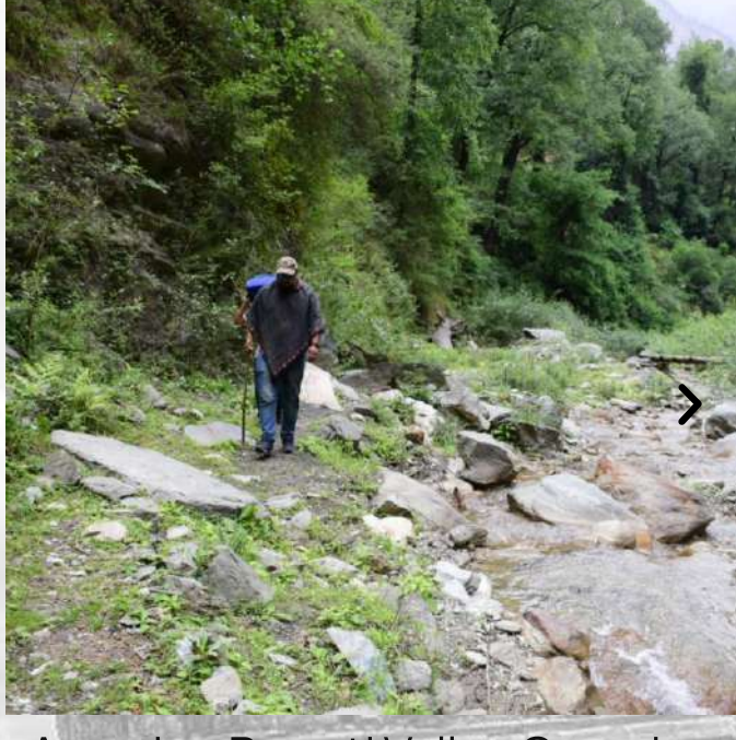
Amazing Parvati Valley Camping